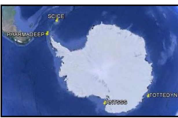
Figure 1: Map showing the research areas submitted to the Call Regional 2.